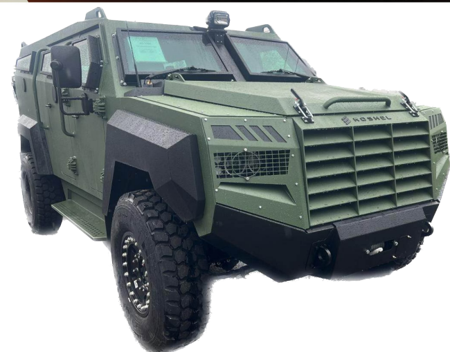
The First Smart Armored Vehicle in the World